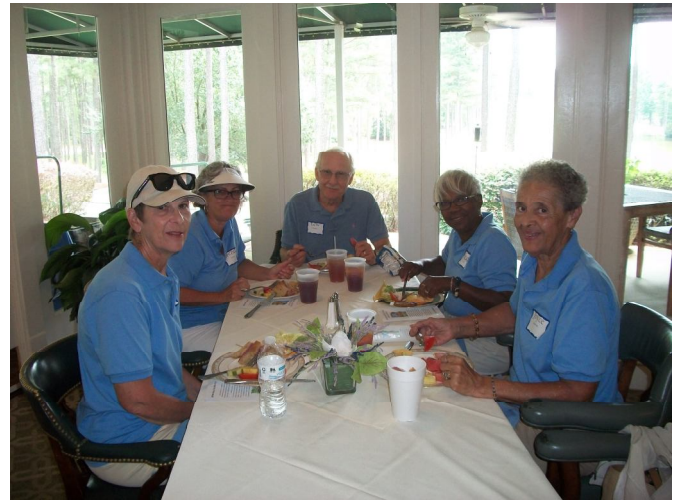
A few of the volunteers who helped make the event a success.